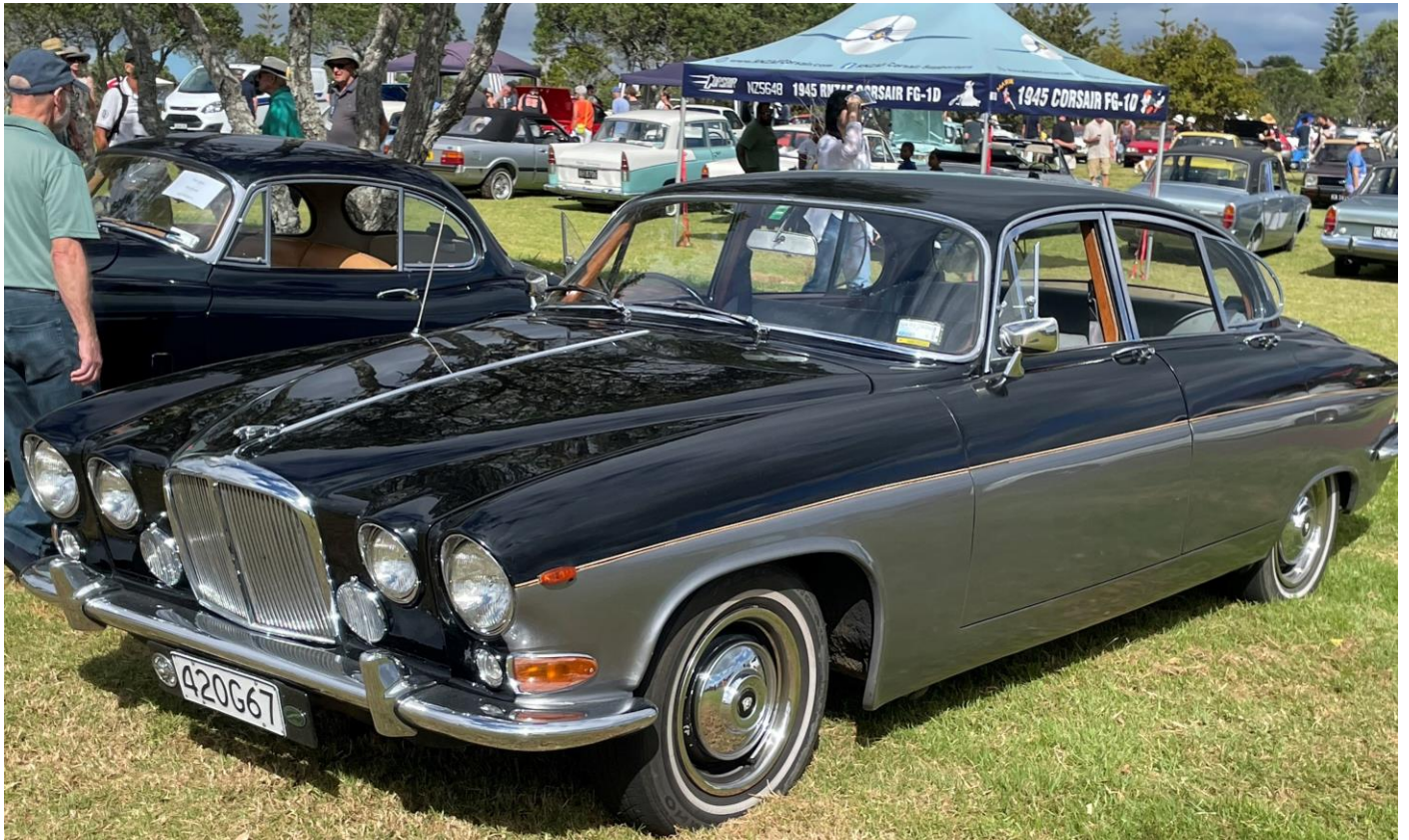
"Hello Beautiful" ....Jaguar 420G ex Classic Jaguar Limousines