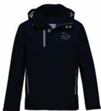
CAT-NJ RAIN JACKET BLACK / ALUM ALUM / BLUE $127.95