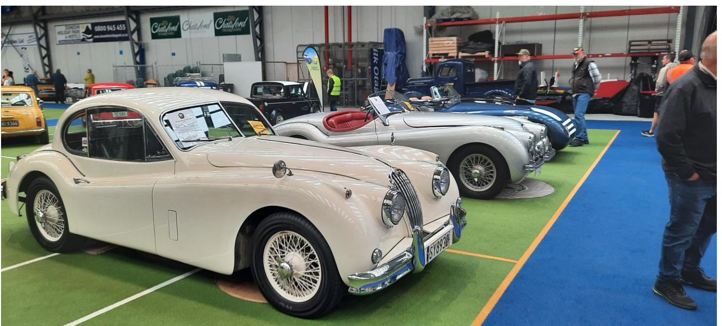
XK140, XK120 C Type and (obscured) E Type.