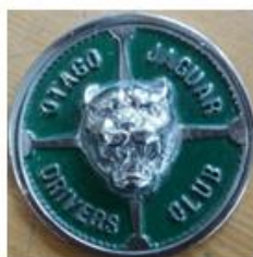
Grille Badge $35.00

Name That Movie: Car No 15 1974 Jaguar E Type Series 3; "Convoy" 1978