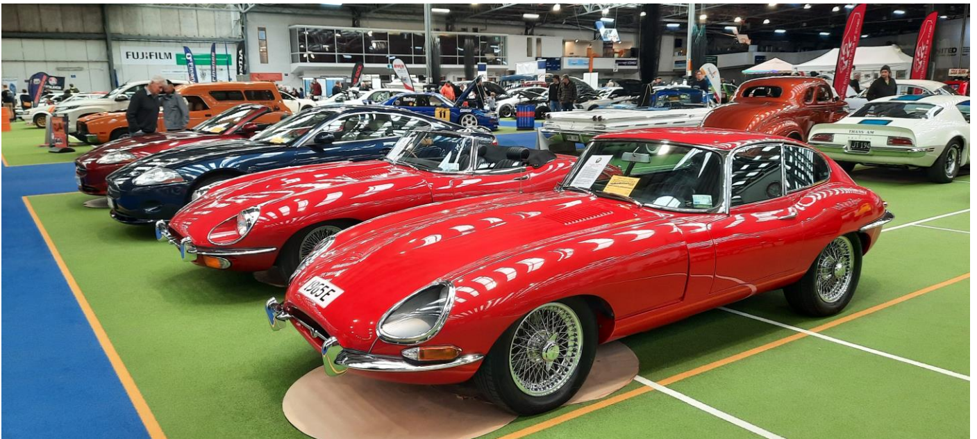
Two XKs and Two E types.

Accompanying the XJS on the stand were six sports cars (a fixed head and convertible of each model) XK120/140, E Type & XK4.2 and a C Type.